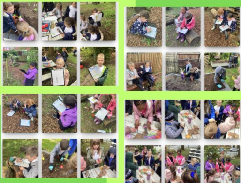
We will be entering Heywood in Bloom this year

In Gardening Club over the last 2 weeks, the children have had lots of fun making caterpillar grass heads and creating water colour paintings. They planted plugs into planters.