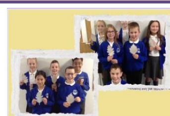
Year 5 demonstrated how they can respect each other in school, home & community. They wrote some prayers about Respect

Matthew 19:19 Respect your father and mother and love your neighbour as yourself.