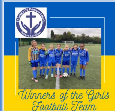
Winners of the Girls Football Team

Well Done To Our Girls & Boys Football Teams